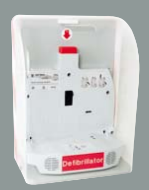
PRIMEDIC™ SaveBox Also available as SaveBox advanced with acoustic and visual alarm