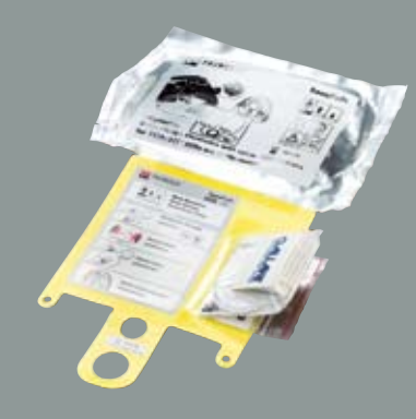
PRIMEDIC™ SavePads With brief instructions. Available in various languages.