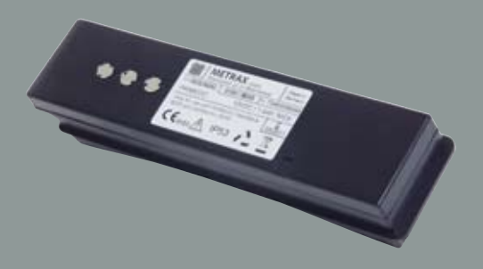
PRIMEDIC™ battery 3/battery 6 3 years standby time 6 years standby time