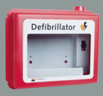
PRIMEDIC<sup>™</sup> wall box For public buildings. Standard colour: red