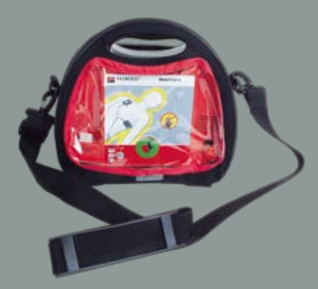
PRIMEDIC<sup>™</sup> HeartSave carrying bag With rear stowage compartment and viewing window, incl. shoulder strap and shoulder pad