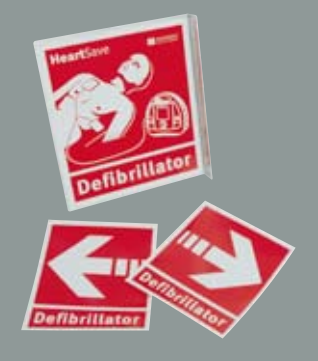
PRIMEDIC<sup>™</sup> Defibrillator label 2 defibrillator location labels, 12 direction arrows right and left

Available in a range of colours, water and dustproof, fracture-proof, 380 x 270 x 180 mm. Standard colours: black or orange, other colours available on request